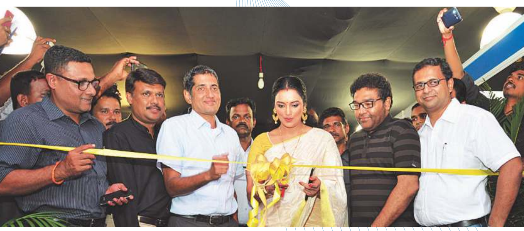
Renowned\ actress\ Shweta\ Menon\ in augurating\ CERA\ Vanitha\ Veedu\ Exhibition\ held\ at\ Kochi

The objective of participating in a consumer exhibition is to showcase products and extend an opportunity for consumers to touch and feel the products. Objective accomplished.