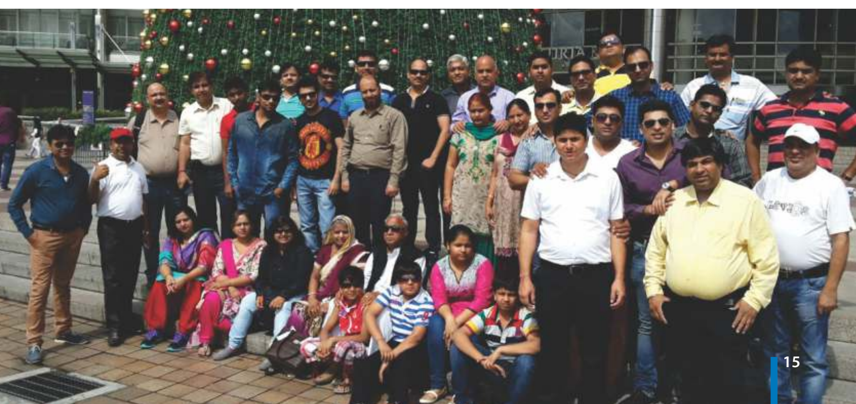
Upper North dealers at Malaysia