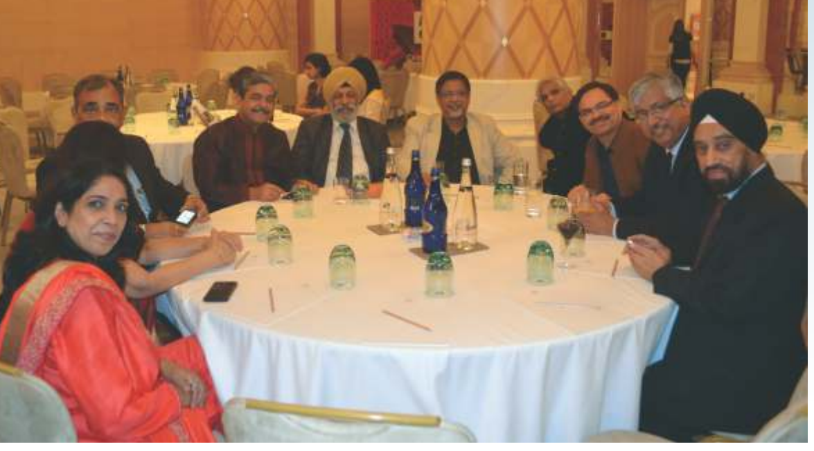
Architects at the event

Architect Dogan Hasol, who presided as the chief guest, addressed the audience and shared some similarities between India and Turkey saying, "My opinion in general is that India is not only a country of democracy and tolerance, but a country of unique architecture as well." He further elaborated, "I couldn't help but notice that there are similarities between India and Turkey. For example they share Eastern cultural values and attachment to traditions. Another similarity can be found between the planning process of Chandigarh as the new capital of Punjab and the formation of Ankara as the new capital of the Republic of Turkey." Elucidating about Istanbul as one of the most outstanding cities in history, he said, "It was the capital of three empires throughout many centuries with its extraordinary beauty, with its cultural and historical legacy."