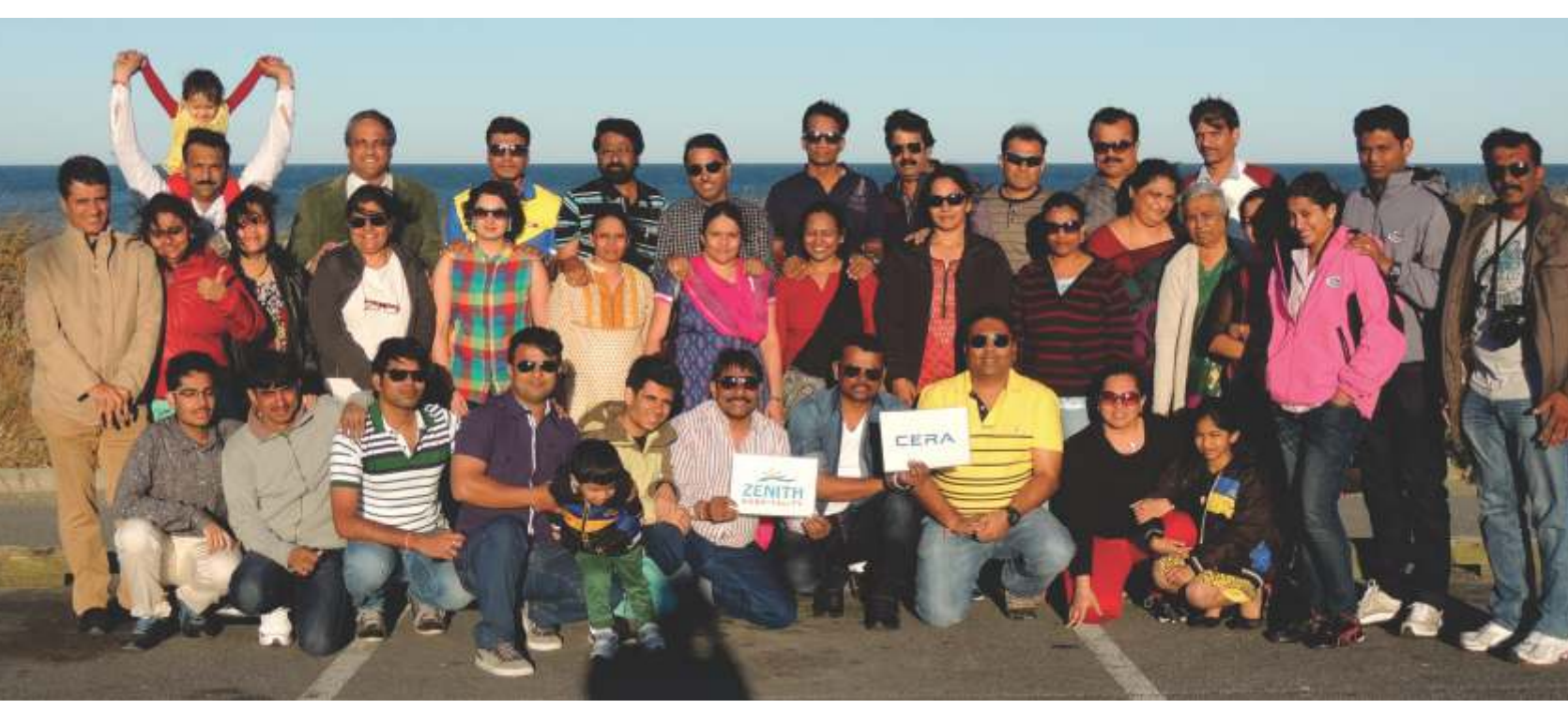
Karnataka dealers during their trip to New Zealand