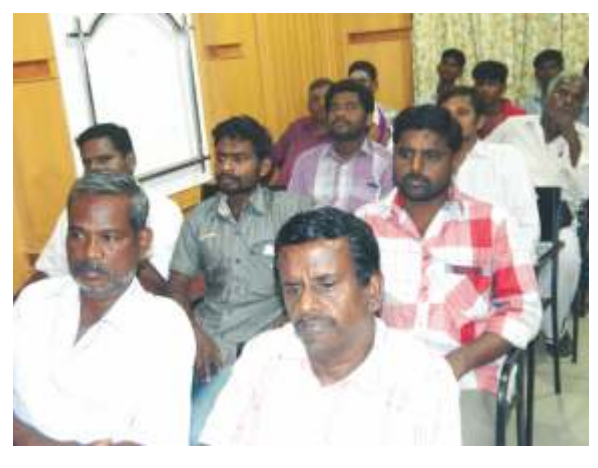
A joint plumber meet was held by CERA and Krishna Hardwares at Trichy