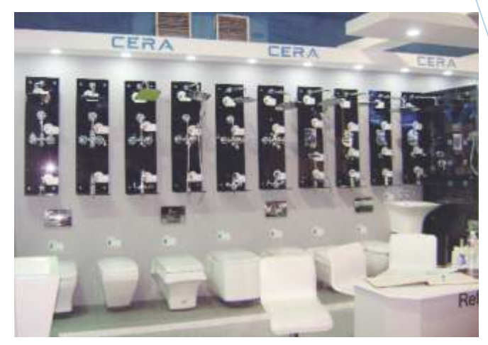
CERA participated in Home & Decor Exhibition held at Science City Exhibition Ground, Kolkata wherein CERA had put up a stall to display its new products