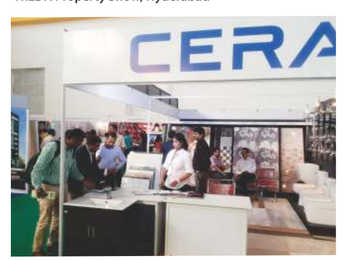
Encouraged by the overwhelming response of the consumers in the last CREDAI Property Show, CERA participated in the TREDA Property Show. And the people of new state did not disappoint CERA this time either. Visitors collecting information and getting familiar with CERA products