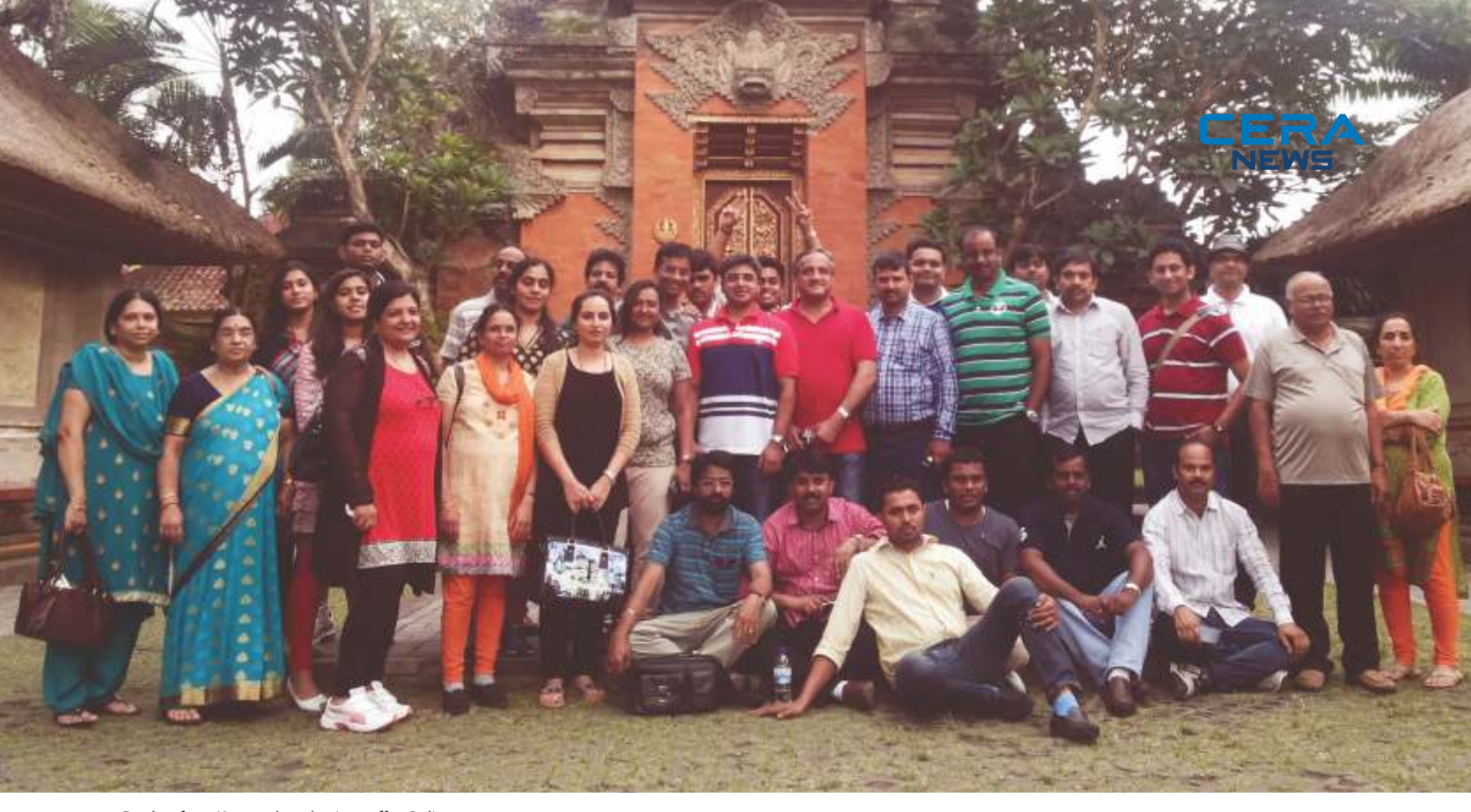
Dealers\, from\, Karnataka\, take\, time-off\, at\, Bali